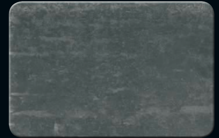
EuraZinc Pro Weathered